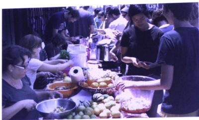
The Ordinary Arts of Political Activism

produces not debt but rather what Lewis Hyde terms “feeling-bonds” 13 as its objective: social relations, then, instead of market relations. As Jörgen Svensson notes of so-termed “generosity projects” in a different context, “the broader phenomenon is really about food, people meeting each other, and an opportunity for increased communication.” 14